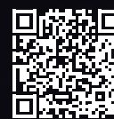
RUT955 360° VIEW

// RUT955 is a highly reliable industrial LTE Cat 4 router that delivers high performance and GNSS location capabilities.