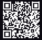
RUTX09 360° VIEW

// RUTX09 is LTE-A Cat 6 cellular IoT router with Dual-SIM, Carrier Aggregation, and 4 Gigabit Ethernet interfaces.