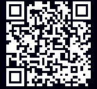
RUTC50 360° VIEW

Unleash the full potential of your edge applications with the RUTC50 5G router. This compact powerhouse combines ultra-fast 5G (up to 3.4 Gbps), dual-band Wi-Fi 6, and enhanced processing power with 1GB RAM and 8GB flash memory. Featuring dual SIM and eSIM for global, touch-free deployments, the RUTC50 delivers lightning-fast, low-latency communication for mission-critical operations. Rugged, powerful, and future-ready.