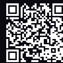
RUT241 360° VIEW

The RUT241 eSIM™ is an industrial cellular router featuring LTE Cat 4 and eSIM™ with SGP.22 pull-based consumer architecture. This compact router supports a physical SIM card with up to seven eSIM™ profiles, which can be managed via WebUI and RMS. The RUT241 eSIM™ ensures uninterrupted connectivity with automatic WAN failover and two Ethernet ports, making it an ideal choice for M2M and IoT solutions.