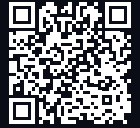
TRM200 360° VIEW